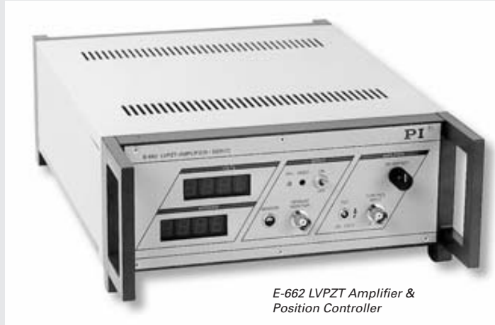
E-662 LVPZT Amplifier & Position Controller